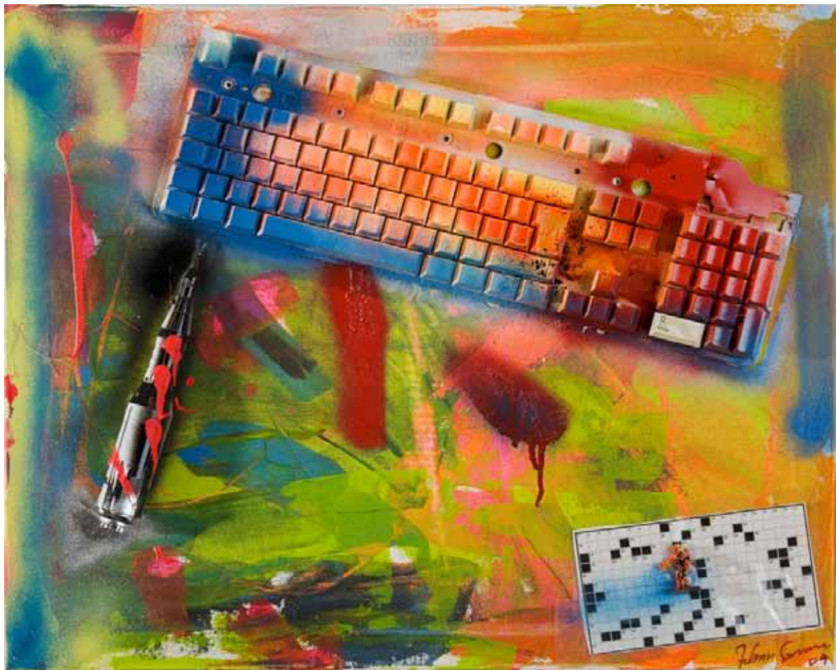
Fabrizio SANNA Enter Space, 2010 Mixed media on canvas 100 x 80 cm