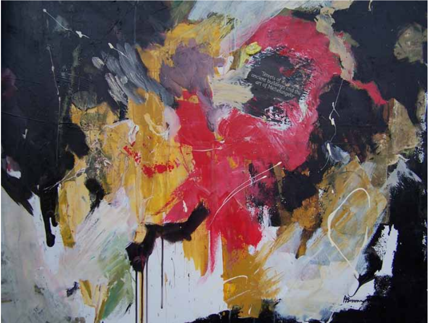
Piera BESSONE Untitled, 2012 Mixed media on canvas 100 x 100 cm