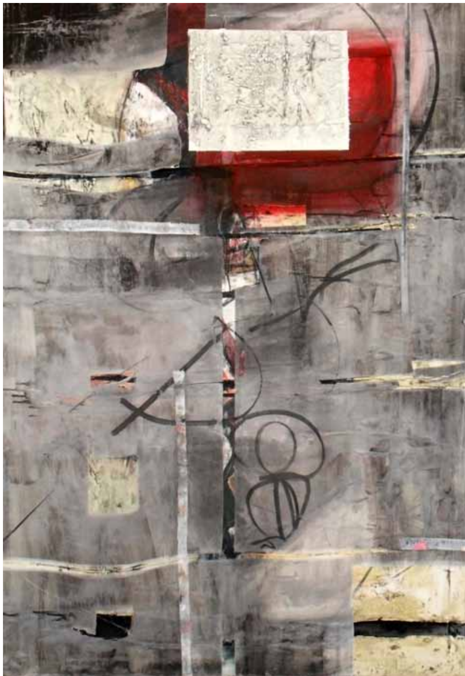
Conny VERELLEN The wall, 2010 Mixed media on canvas 150 x 100 cm