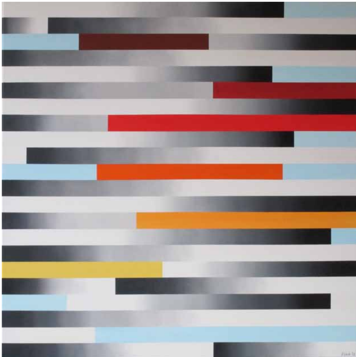
Cornelis VINK Shooting colors, 2013 Oil on canvas 80 x 80 cm