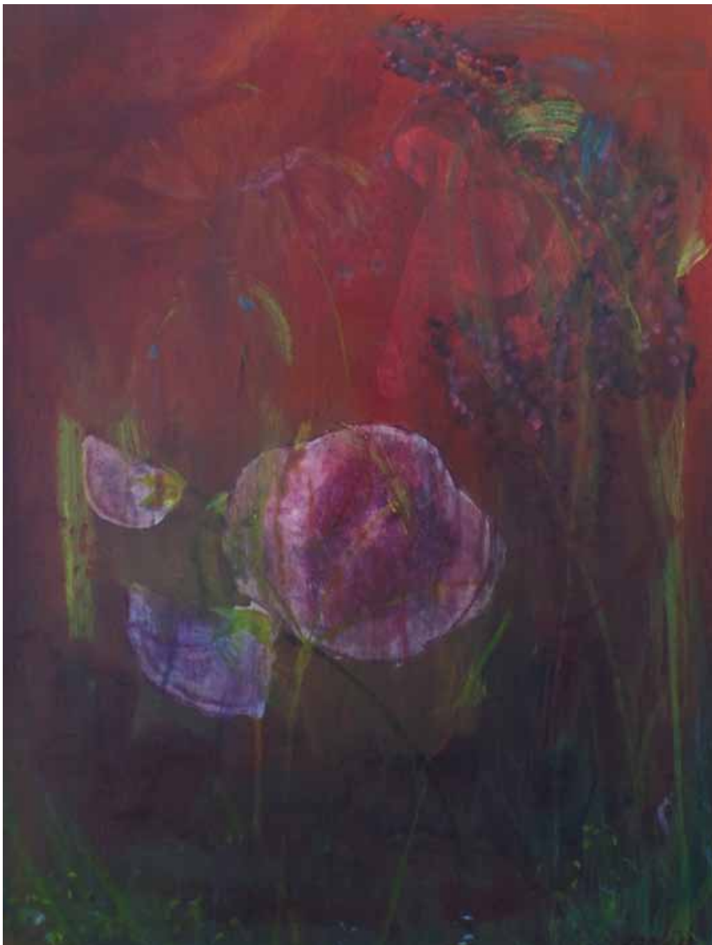
Katrine POMMER Jeg søger i tusind søers land, jeg søger efter svar, 2011