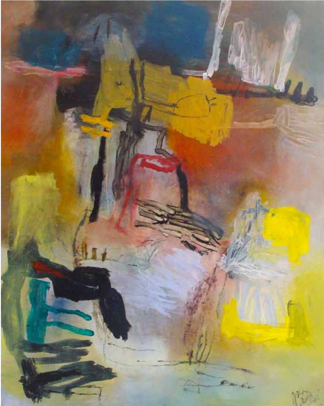
Mette RIX Untitled, 2012 Oil on canvas 100 x 80 cm