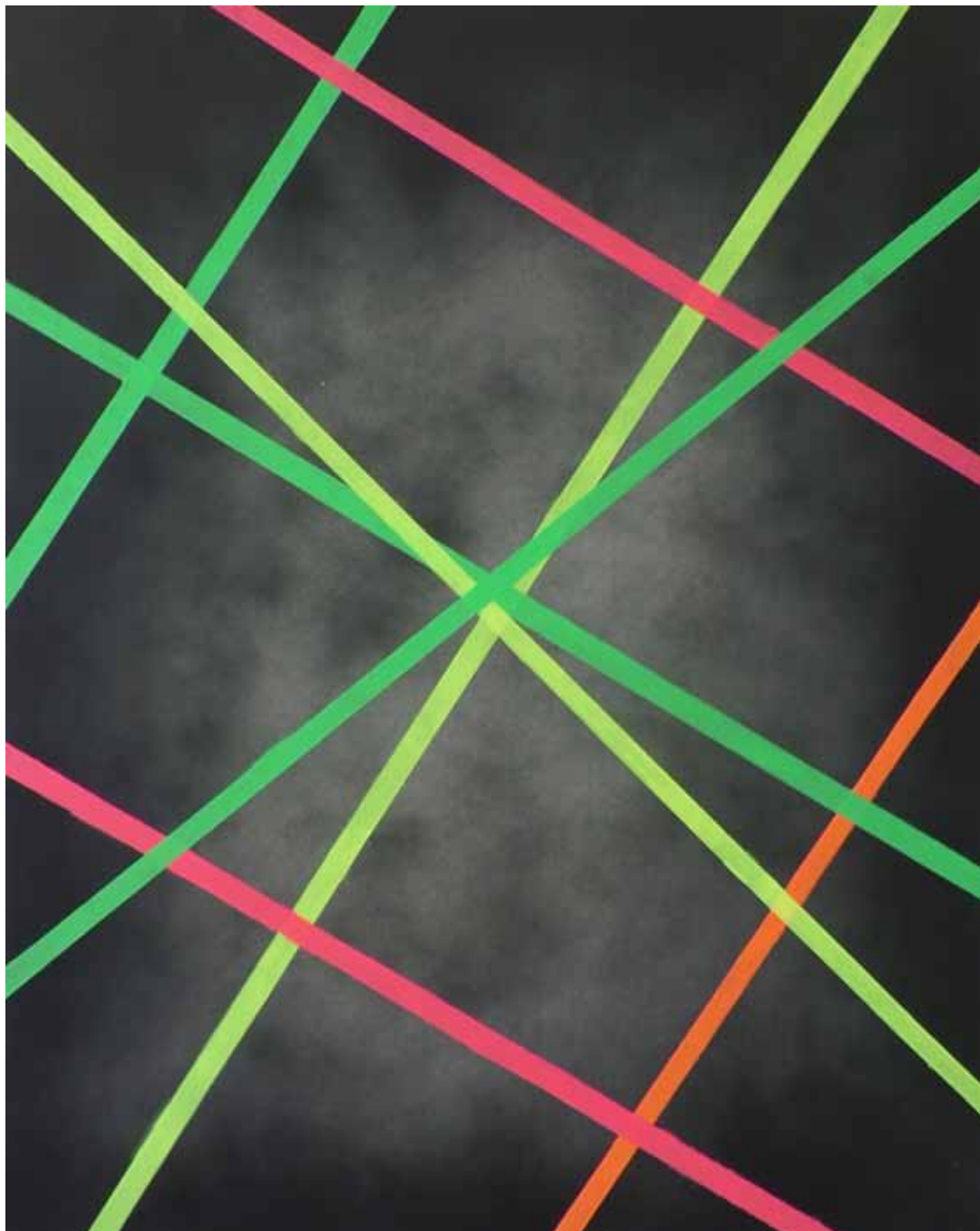
Javier RAMIREX Supernova, 2013

Acrylic, spray paint on canvas 100 x 80 cm