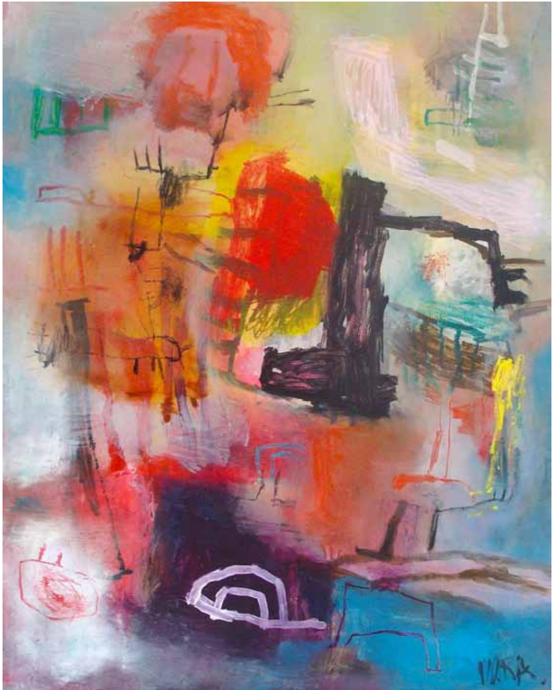
Mette RIX Untitled, 2012 Oil on canvas 100 x 80 cm