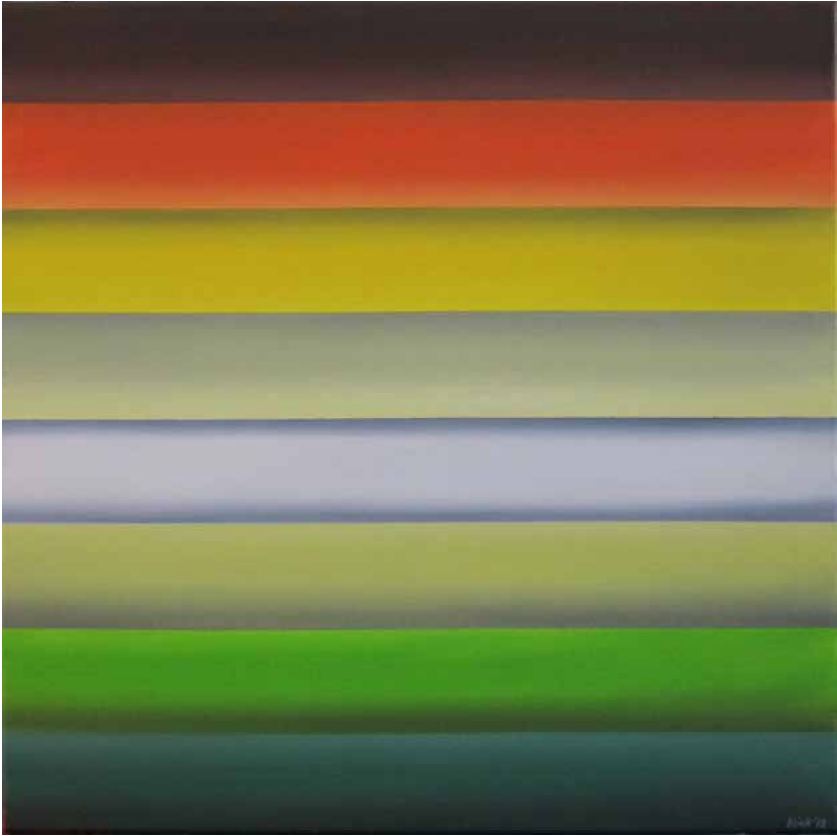
Cornelis VINK Falling Green, 2012